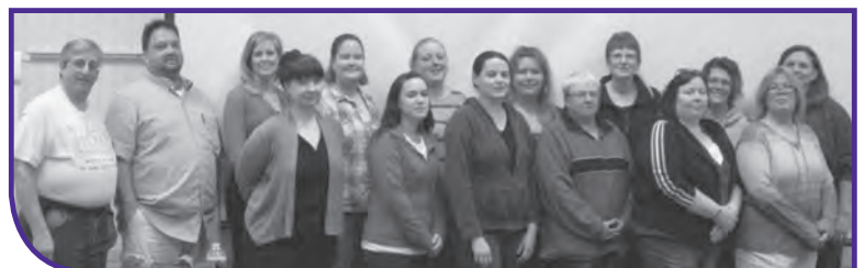
Leadership Program graduates in Pella on Dec. 4, 2012

Congratulations to this great group of graduates!