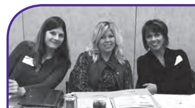
Marshalltown Regional Listening Session