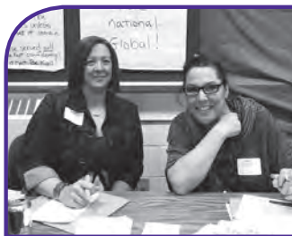
Regional Direct Care Workforce 2020 Sessions Wrap Up in Marshalltown Continued on page 6

Direct Care Workforce Summit Hosted by Iowa Department of Public Health Page 9 for more