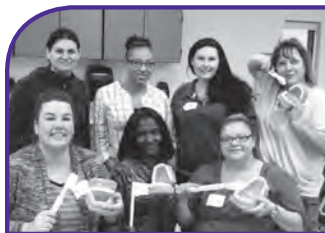
Mouth Care Matters

Mouth Care Matters Will Continue for Two More Years with Renewed Funding from Delta Dental of Iowa Foundation, Mid-Iowa Health Foundation, and the Iowa Department of Public Health