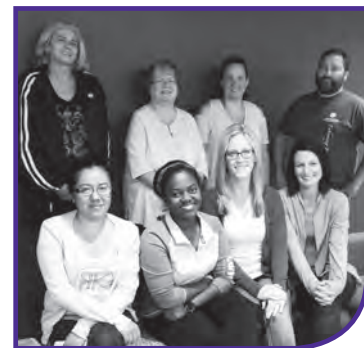
Prepare to Care Waterloo Session