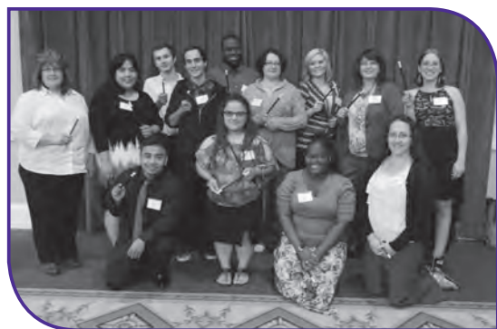
Ottumwa Job Corps Students